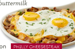
PHILLY CHEESESTEAK SKILLET

two eggs, any style, two bacon strips, two sausage links, ham, mushrooms, green peppers, tomatoes, onions and melted cheddar cheese on breakfast potatoes. 12.25