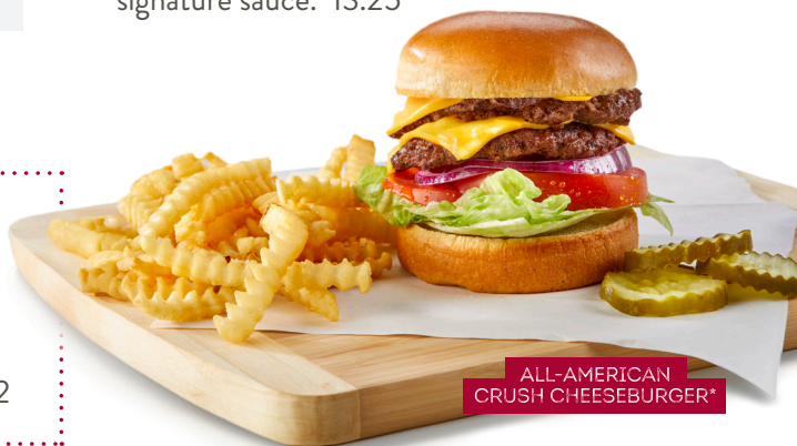
ALL-AMERICAN CRUSH CHEESEBURGER*

two crush patties american cheese, bacon strips, garlic-grilled onions, grilled mushrooms and signature sauce. 13.25