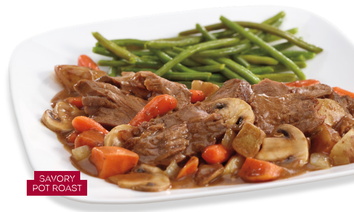
SAVORY POT ROAST

grilled chicken breast and teriyaki stir-fried vegetables with melted swiss cheese on grilled pita. 12.50