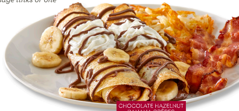
CHOCOLATE HAZELNUT BANANA CRÊPES

two crêpes stuffed with sweet supreme cream and fresh strawberries, topped with strawberries, strawberry sauce and real whipped cream. served with seasoned hash browns. 11.50