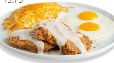
CHICKEN-FRIED STEAK & EGGS

two eggs, any style, two bacon strips, two sausage links and smoked ham. 13.75